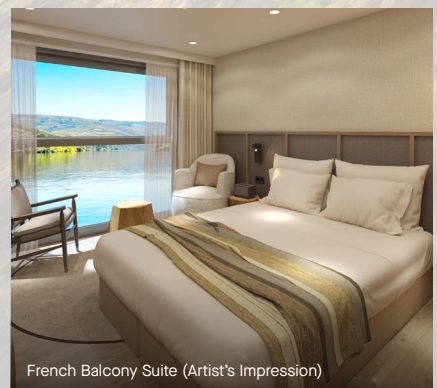
French Balcony Suite (Artist's Impression)