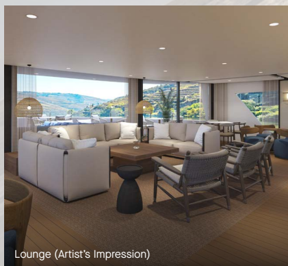
Lounge (Artist's Impression)