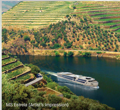
MS Estrela (Artist's Impression)